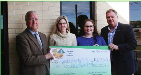
Honored with a $2,000 grant was the Toombs County Extension for their 4-H program. These funds will be used to help students Southeast District Junior/Senior Project Achievement at Rock Eagle 4-H Center.