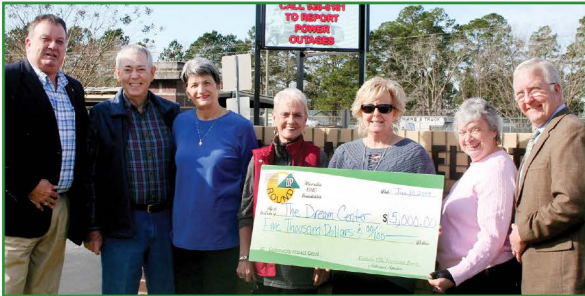
The Voice of Grace Dream Center received a $5,000 grant to help provide appliances for the newly constructed multi-purpose building at the Dream Center campus. The mission of the Voice of Grace Dream Center is to address drug and alcohol addiction in women 18 years of age and older. The outcome of the program is to return women to their families and society equipped to live a drug-free lifestyle.