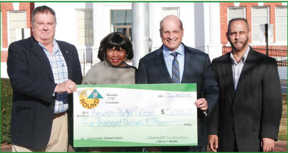
Brewton Parker College received a grant for $5,000 to help fund the construction of a quad of male dormitories at the college.

Griffin states, “As members of the Trust Board, we take the requests we receive very seriously. We go through each application, and we have good conversations with our grantees so that we are sure they are the most deserving of the funding, but it’s not an easy task and it’s not one we take lightly.” Interested charitable organizations and agencies can apply for funding by completing the required application which can be found on our website. The deadline for the next round of funding is June 7, 2019. For more information, contact Tammye Vaughn at 912-526-2120.