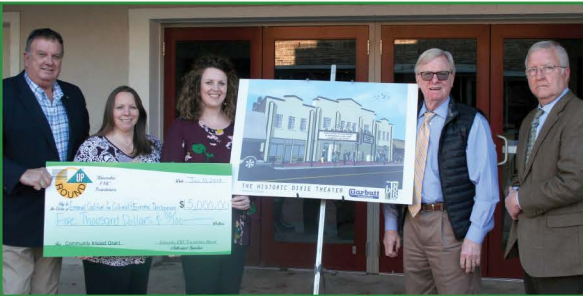
A grant check was issued for $5,000 to Emanuel Coalition for Culture/Economic Development. These grant funds will be used in the preservation of The Historic Dixie Theatre. The theater will house a full-service arts center, an art gallery, and educational/community meeting space. The theater will also feature a stage and equipment for live performances, as well as regular showings of first-run feature films.