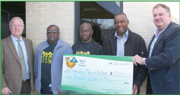
The Community Men in Action group was awarded a $5,000 grant to fund projects for families in need and to help fund the annual Ray Fuller and Robin Matthews Scholarships.