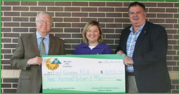
A grant for $3,000 was presented to East Georgia Fellowship of Christian Athletes to help fund scholarships for students and coaches to attend FCA camps.