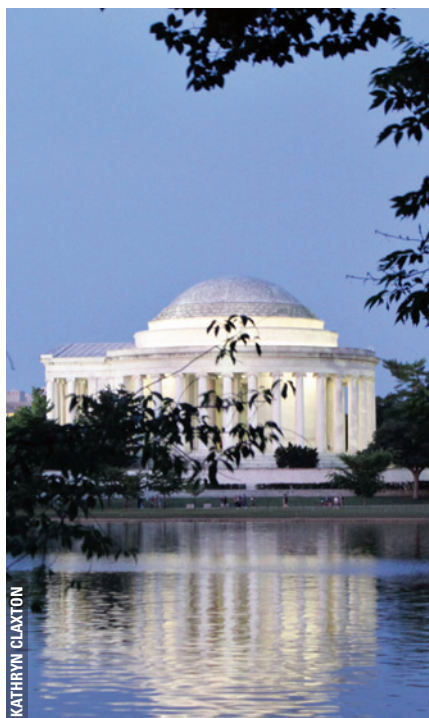
The Jefferson Memorial honors Thomas Jefferson, the main drafter and writer of the Declaration of Independence.

Highlights of the trip included guided tours and stops at Arlington National Cemetery, Smithsonian museums, Holocaust Memorial Museum, Mount Vernon, Supreme Court, U.S. Capitol, Washington Monument and the MLK, FDR, Jefferson, World War II, Korean War Veterans, Vietnam War Veterans and Lincoln Memorials.