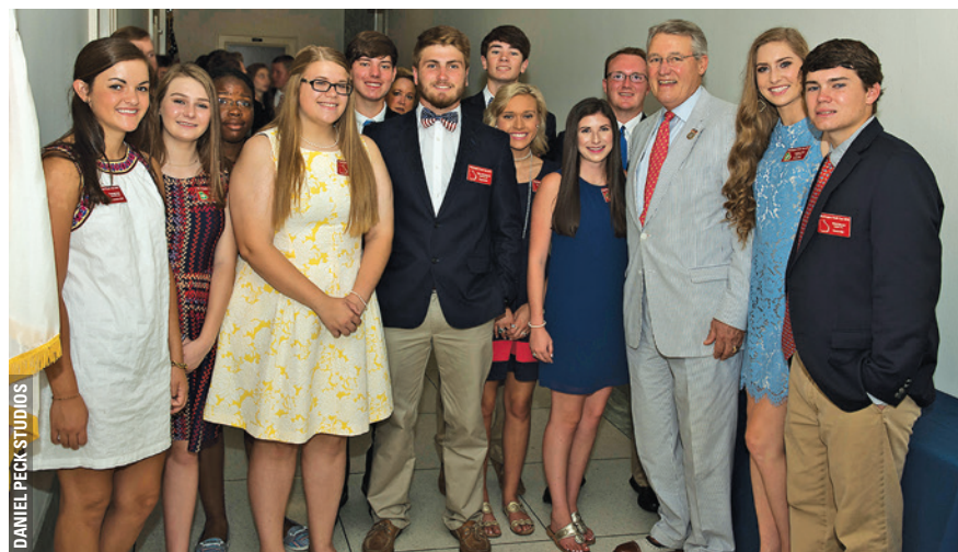
U.S. Rep. Rick Allen (third from right) spent time talking to the WYT delegates about political issues.