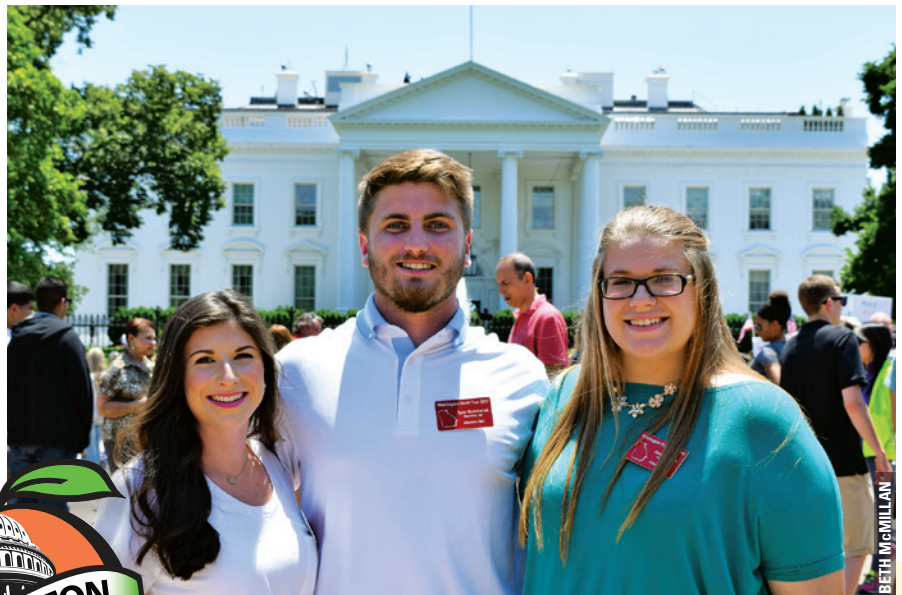
The group enjoyed having a picture taken in front of the White House.

In June 2017, more than 1,700 talented and ambitious students from 43 states descended upon the nation’s capital to take part in the annual pilgrimage known as the Washington Youth Tour (WYT). Altamaha EMC delegates—