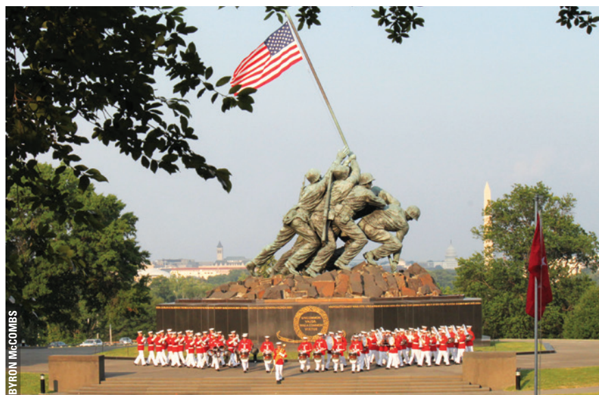
The U.S. Marine Corps War Memorial (more commonly known as the Iwo Jima Memorial) is perhaps one of the most moving memorials in the D.C. region.