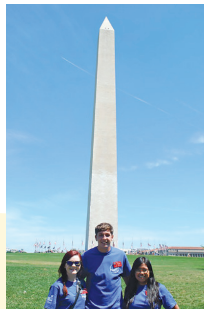
The delegates were all smiles as they posed for a picture at the Washington Monument, a memorial to commemorate George Washington, once commander-in-chief of the Continental Army and the first American president.