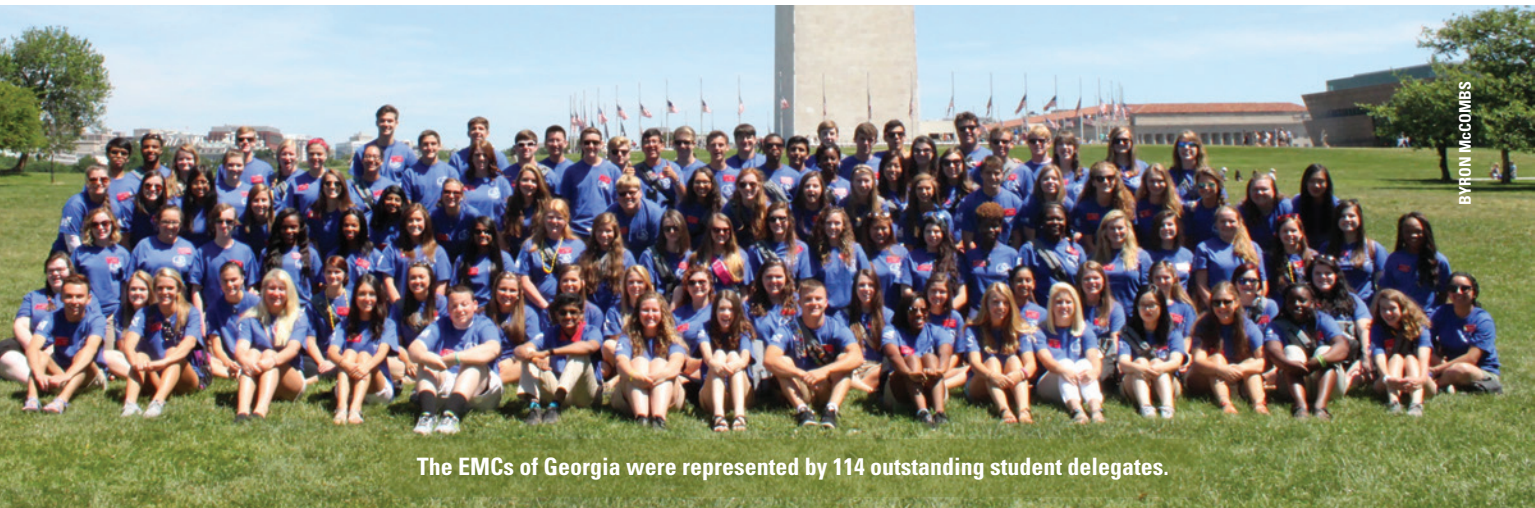
The EMCs of Georgia were represented by 114 outstanding student delegates.